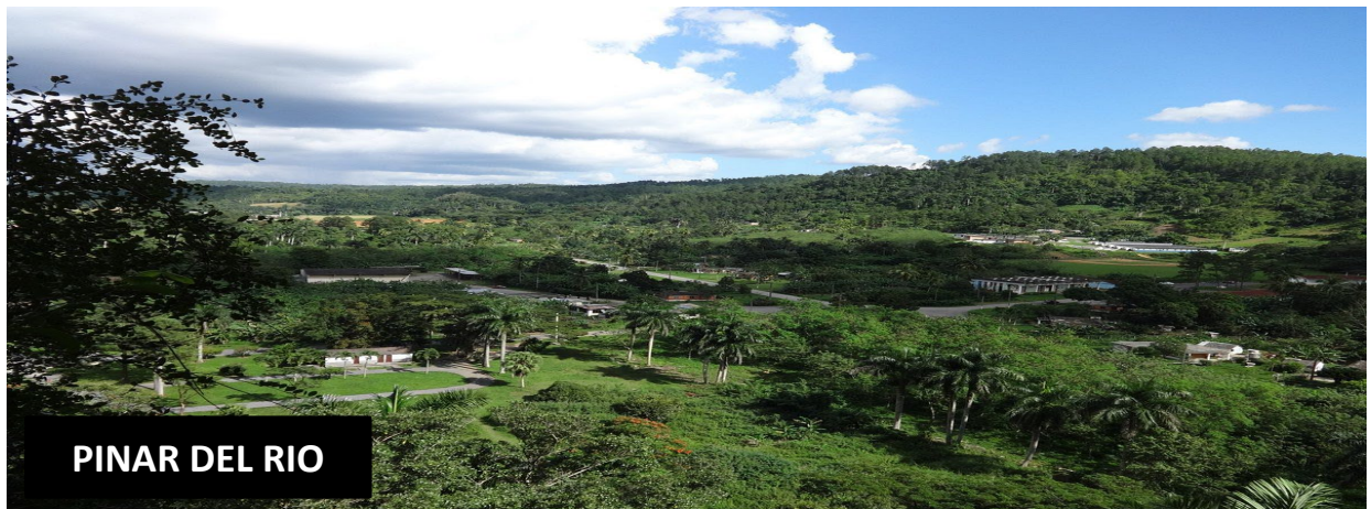
PINAR DEL RIO